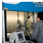
FILTER LEAKAGE TEST