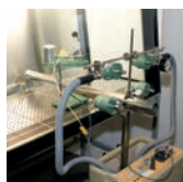
KI DISCUSS TEST