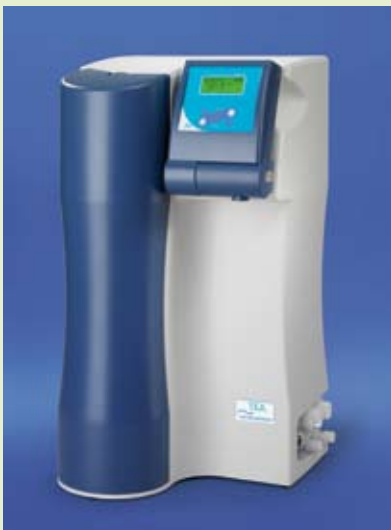
TKA Pacific 3 – 40 AFT Flow rate 3, 7, 12, 20 and 40 l/h.