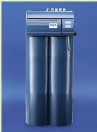
TKA MediTower 60/120 Flow rate 60 and 120 l/h.