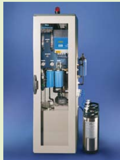
TKA RO 100 – 350 RDS Flow rate 100 up to 350 l/h.